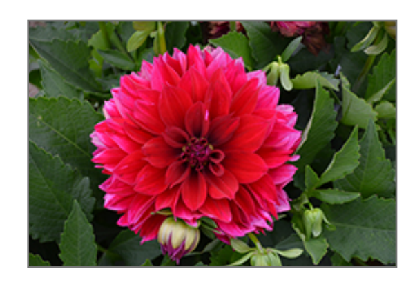
Labella Maggiore Purple Dahlia flowers

A beautiful, long blooming variety that features an upright habit and produces large fuchsia blooms sitting on top of dark green foliage; performs well in containers, garden beds and as borders; great addition to any fresh cut flower arrangement