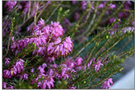
Pink Spangles Heath flowers