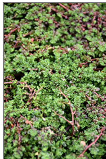
Rupturewort foliage