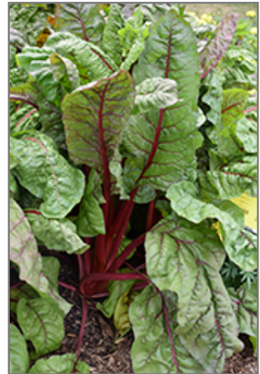
Ruby Red Swiss Chard

Ruby Red Swiss Chard will grow to be about 20 inches tall at maturity, with a spread of 18 inches. When planted in rows, individual plants should be spaced approximately 12 inches apart. This fast-growing vegetable plant is an annual, which means that it will grow for one season in your garden and then die after producing a crop. Because of its relatively short time to maturity, it lends itself to a series of successive plantings each staggered by a week or two; this will prolong the effective harvest period.