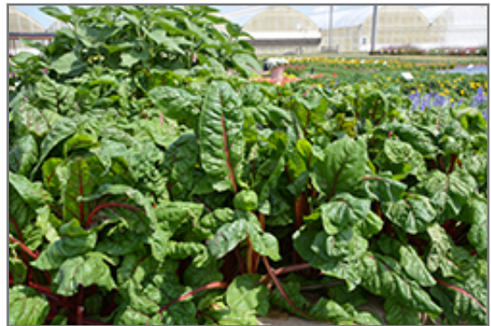
Ruby Red Swiss Chard