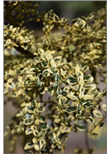
Variegated Box-Leaf Azara foliage

* This is a 'special order' plant - contact store for details