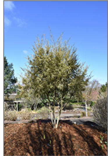
Variegated Box-Leaf Azara

Variegated Box-Leaf Azara is recommended for the following landscape applications;