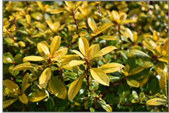
Gold Brian Escallonia foliage

Gold Brian Escallonia is recommended for the following landscape applications;