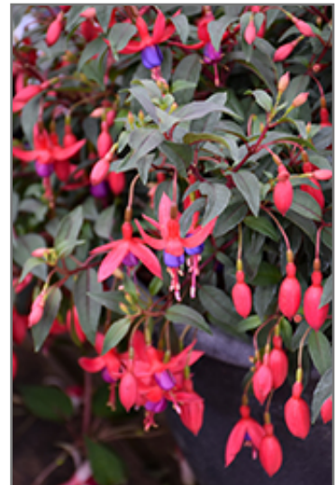
Army Nurse Fuchsia flowers