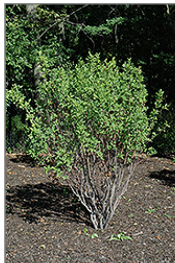
Rainbow Pillar Serviceberry

This is a relatively low maintenance shrub, and should not require much pruning, except when necessary, such as to remove dieback. It is a good choice for attracting birds to your yard, but is not particularly attractive to deer who tend to leave it alone in favor of tastier treats. It has no significant negative characteristics.