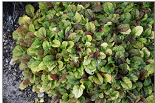
Feathered Friends Parrot Paradise Bugleweed