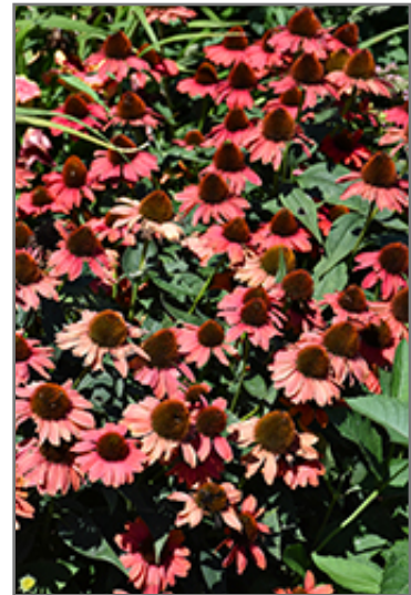
Color Coded Frankly Scarlet Coneflower flowers

This is a relatively low maintenance plant, and is best cleaned up in early spring before it resumes active growth for the season. It is a good choice for attracting bees and butterflies to your yard, but is not particularly attractive to deer who tend to leave it alone in favor of tastier treats. It has no significant negative characteristics.