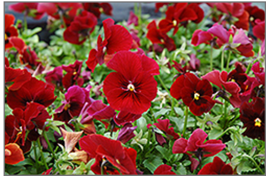
Penny Red Pansy flowers