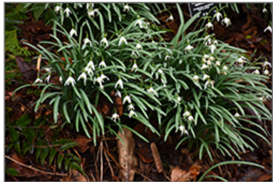
Common Snowdrop in bloom