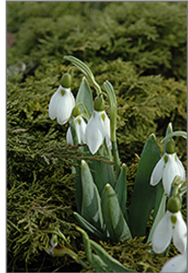
Common Snowdrop flowers

Common Snowdrop is recommended for the following landscape applications;