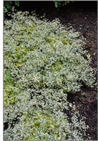
Golden Feathers Jacob's Ladder foliage

Golden Feathers Jacob's Ladder is recommended for the following landscape applications;