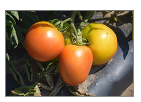
Oregon Spring Tomato fruit

Oregon Spring Tomato will grow to be about 4 feet tall at maturity, with a spread of 24 inches. When planted in rows, individual plants should be spaced approximately 24 inches apart. Because of its vigorous growth habit, it may require staking or supplemental support. This fast-growing vegetable plant is an annual, which means that it will grow for one season in your garden and then die after producing a crop.