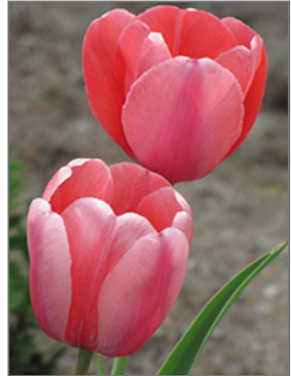
Pink Impression Tulip flowers