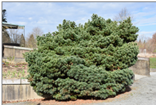
Blue Shag White Pine