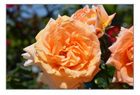
Forever Amber Rose flowers