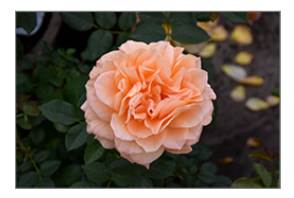
Forever Amber Rose flowers

Forever Amber Rose is recommended for the following landscape applications;