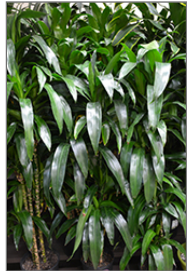
Lisa Dracaena foliage

When grown indoors, Lisa Dracaena can be expected to grow to be about 5 feet tall at maturity, with a spread of 24 inches. It grows at a medium rate, and under ideal conditions can be expected to live for approximately 10 years. This houseplant performs well in both bright or indirect sunlight and strong artificial light, and can therefore be situated in almost any well-lit room or location. It does best in average to evenly moist soil, but will not tolerate standing water. The surface of the soil shouldn't be allowed to dry out completely, and so you should expect to water this plant once and possibly even twice each week. Be aware that your particular watering schedule may vary depending on its location in the room, the pot size, plant size and other conditions; if in doubt, ask one of our experts in the store for advice. It will benefit from a regular feeding with a general-purpose fertilizer with every second or third watering. It is not particular as to soil type or pH; an average potting soil should work just fine.