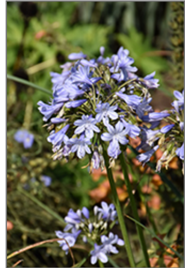
Charlotte Agapanthus flowers

Charlotte Agapanthus is recommended for the following landscape applications;