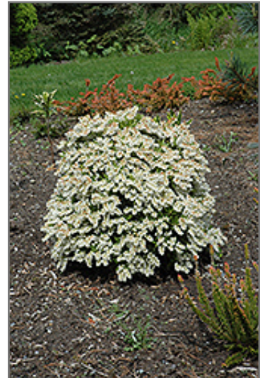
Prelude Japanese Pieris in bloom