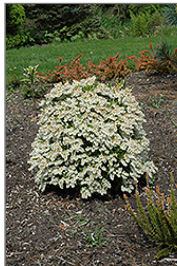
Prelude Japanese Pieris in bloom