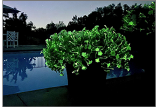
Firefly Petunia flowers

Firefly Petunia will grow to be about 10 inches tall at maturity, with a spread of 10 inches. When grown in masses or used as a bedding plant, individual plants should be spaced approximately 10 inches apart. Its foliage tends to remain low and dense right to the ground. This fast-growing annual will normally live for one full growing season, needing replacement the following year.