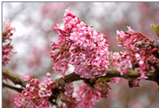
Dawn Viburnum flowers

Dawn Viburnum is recommended for the following landscape applications;