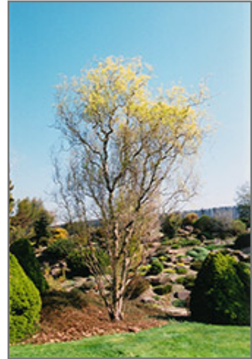
Dragon's Claw Willow in winter