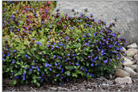
Plumbago in bloom