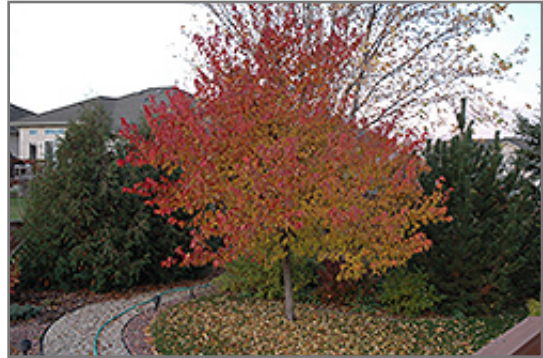
Embers Amur Maple in fall