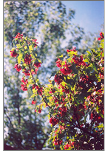
Embers Amur Maple fruit

* This is a 'special order' plant - contact store for details