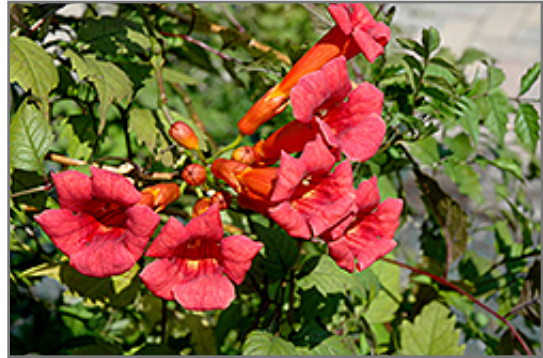
Balboa Sunset Trumpetvine flowers