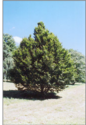
American Hornbeam

The American Hornbeam is recommended for the following landscape applications;