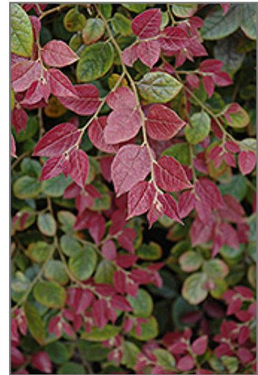
Razzleberri Fringeflower foliage