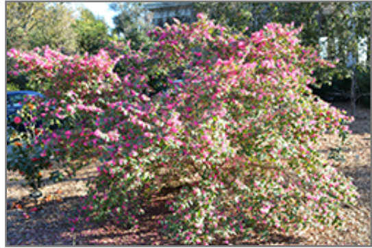
Razzleberri Fringeflower in bloom

This shrub does best in full sun to partial shade. It prefers to grow in average to moist conditions, and shouldn't be allowed to dry out. It is particular about its soil conditions, with a strong preference for rich, acidic soils. It is somewhat tolerant of urban pollution. Consider applying a thick mulch around the root zone in winter to protect it in exposed locations or colder microclimates. This is a selected variety of a species not originally from North America.