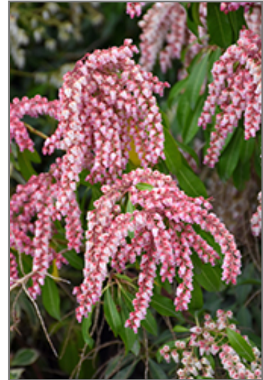
Valley Rose Japanese Pieris flowers