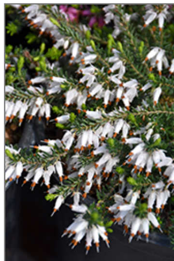
Springwood White Heath flowers