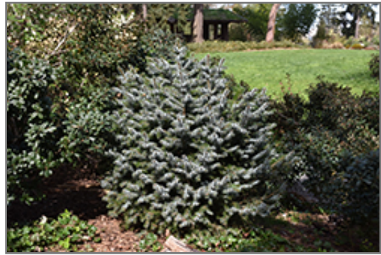
Papoose Dwarf Sitka Spruce