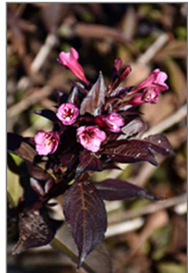
Fine Wine Weigela flowers