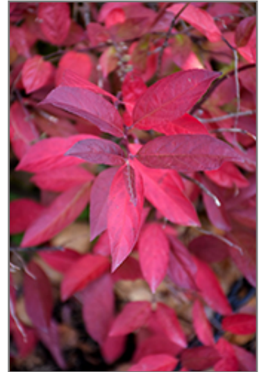
Henry's Garnet Virginia Sweetspire in fall

This shrub performs well in both full sun and full shade. It is an amazingly adaptable plant, tolerating both dry conditions and even some standing water. It is not particular as to soil type or pH. It is somewhat tolerant of urban pollution. This is a selection of a native North American species.