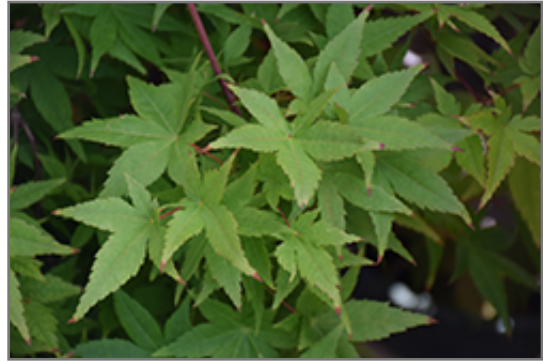
Ryusen Japanese Maple foliage