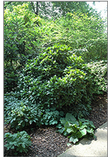
Roxanne Aucuba

Roxanne Aucuba will grow to be about 4 feet tall at maturity, with a spread of 4 feet. It has a low canopy. It grows at a fast rate, and under ideal conditions can be expected to live for approximately 20 years.