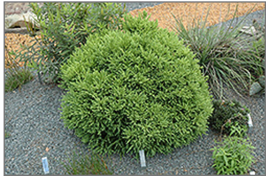
Little Diamond Japanese Cedar