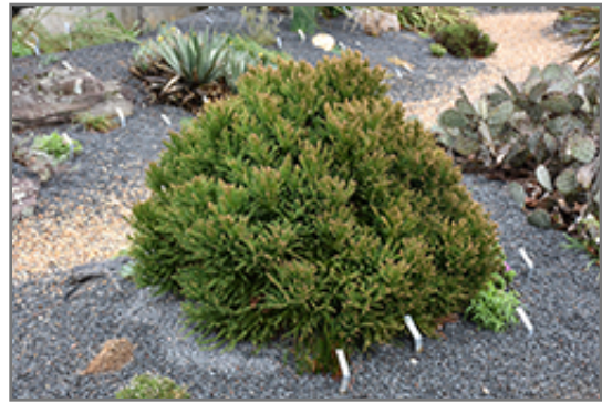
Little Diamond Japanese Cedar

Little Diamond Japanese Cedar makes a fine choice for the outdoor landscape, but it is also well-suited for use in outdoor pots and containers. It can be used either as 'filler' or as a 'thriller' in the 'spiller-thriller-filler' container combination, depending on the height and form of the other plants used in the container planting. It is even sizeable enough that it can be grown alone in a suitable container. Note that when grown in a container, it may not perform exactly as indicated on the tag - this is to be expected. Also note that when growing plants in outdoor containers and baskets, they may require more frequent waterings than they would in the yard or garden.