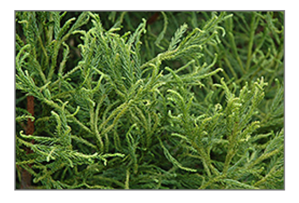
Spiraliter Falcata Japanese Cedar foliage