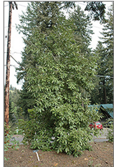
Tanbark Oak