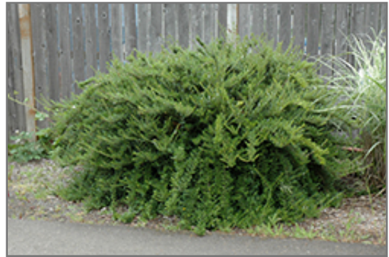
Box Honeysuckle

Box Honeysuckle is recommended for the following landscape applications;