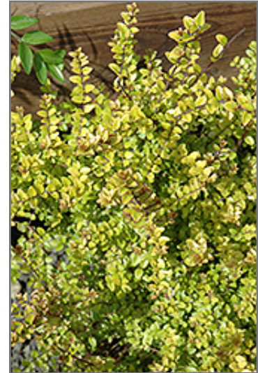
Baggesen's Gold Box Honeysuckle foliage